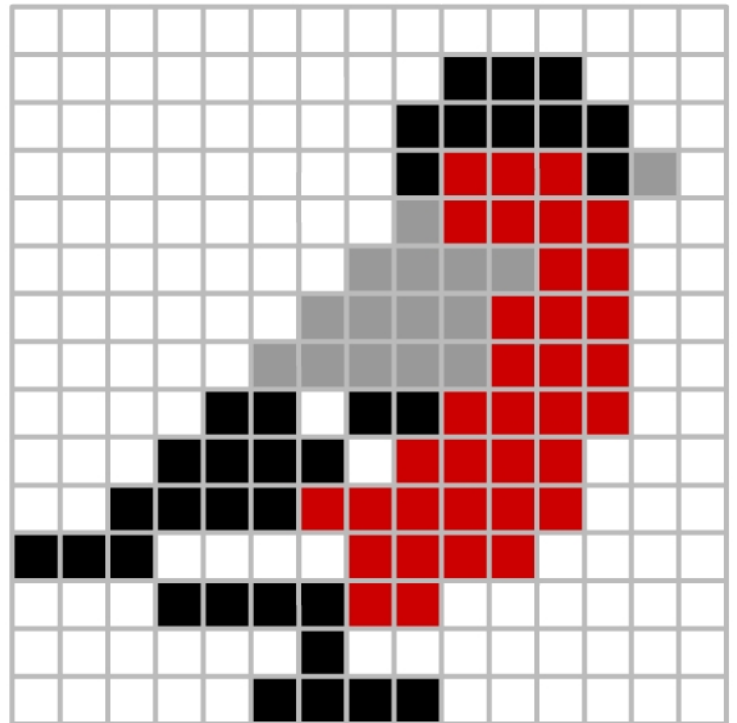
Rysunek 2 - gil